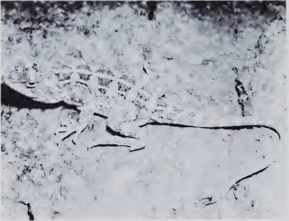
Figure 2 Holotype of Tympanocryptis lineata houstoni , photographed in life by G. Harold.